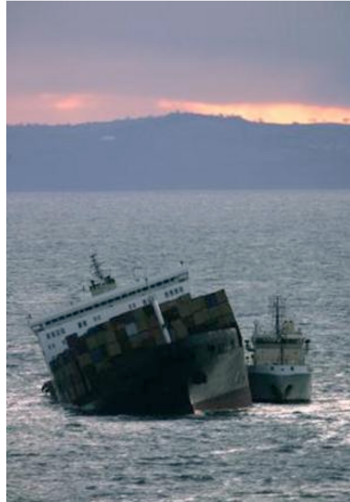
MSC Napoli on tug.

MSC Napoli was towed in the bay of Lyme in the night of Friday. 26 members of the crew were saved.