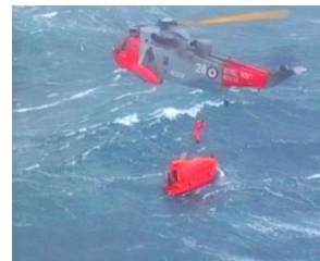
helicopter helping members of crew

MSC Napoli - 16 years old - left Antwerp and was normally going to Portugal. But it failed 100 kilometers off the north coast of Ushant because a crack at the level of the hull was caused by the storm. On the boat, there were 26 members of crew, all of them were saved without any wound. It transported 2,394 containers which contained 41,773 tons of